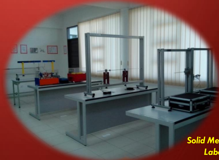
Solid Mechanics Laboratory