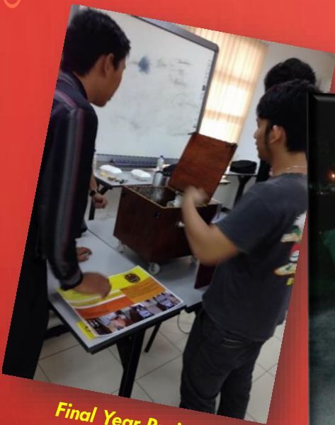
Final Year Project Exhibition

Indeed, i -CATS alumni are making their mark, contributing positively to the progress and vibrancy of the broad canvas of industry. Enrolment to the Diploma in Mechanical Engineering programme is now ongoing for the March 2017 session. Students who have completed SPM/SPMV with a minimum of three credits including Mathematics and one science/technical/vocational subject and a pass in English are eligible to enter the i -CATS Diploma in Mechanical Engineering programme. Applications will also be considered for those who have completed an MQA Accredited Certificate in Engineering/Technology programme (MQF Level 3) with a minimum Cumulative Grade Point Average of 2.0.