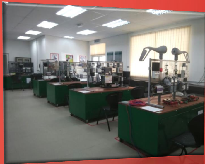
Green Technology Laboratory

During their studies at i-CATS , mechanical engineering students also appreciate the importance of innovation and technological advances in fostering an environmentally sustainable society. In this respect, a major point of pride is the i-CATS Green Technology Laboratory which enables engineering students to acquire theoretical knowledge and practical skills in the study of hydro power technology, solar photovoltaic technology, wind turbine technology and various other sources of renewable energy. This enriches the mechanical engineering curriculum which covers the design, manufacture and maintenance of mechanical devices for industrial processes. It is this exposure to cutting-edge technologies during the two-and-a-half-year programme which gives i-CATS students the competitive edge as they prepare for careers in the field of mechanical engineering or further their studies at the degree-level.