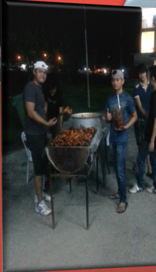
Student Activity: BBQ