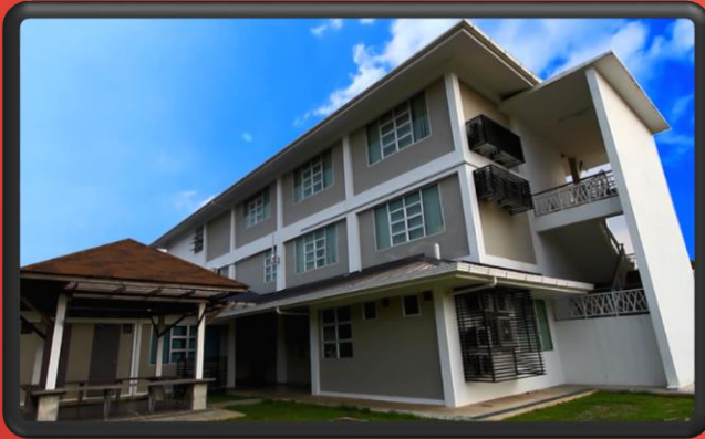
i-CATS East Campus Tabuan Jaya, Kuching

A t the International College of Advanced Technology Sarawak ( i-CATS ), the Diploma in Mechanical Engineering programme has long been regarded as an all-important first step for aspiring engineers, leading to a wide range of careers.